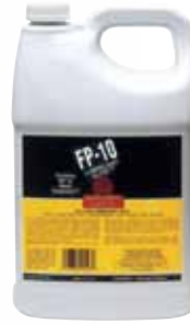
ITEM # FPL128 1 gal. (Plastic container)