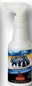
ITEM # ACD016 16 oz. (Pump sprayer)