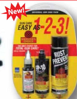
ITEM # CLP01