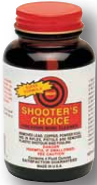
ITEM # MC704 4 oz. (Wide mouth jar)