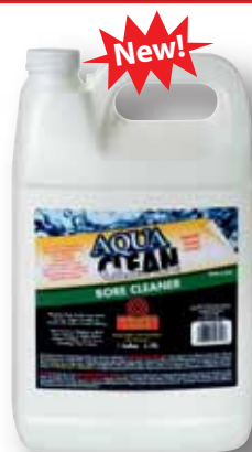
ITEM # ACB128 1 Gal. (Plastic container)