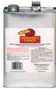
ITEM # MC7128 1 gal. (Tin)