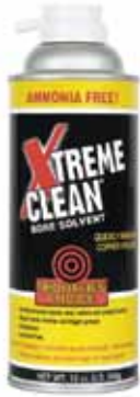
ITEM # XT012 12 oz. (Aerosol with extension tube)

When Extreme Accuracy is Essential Use the One and Only Ammonia Free Aerosol Cleaner Formulated for the Care and Maintenance of Rifles and Handguns.