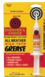
ITEM # G10CC 10 cc (Handy syringe applicator)

Retail point of purchase display contains 36-.5 oz bottles. Only 6" x 6" x 6"