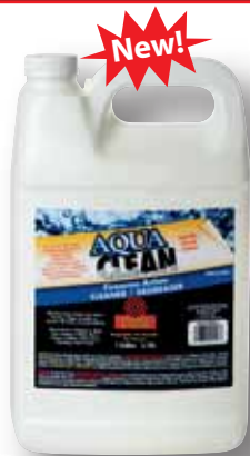
ITEM # ACD128 1 Gal. (Plastic container)