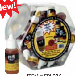
ITEM # FPL036 (Counter display)